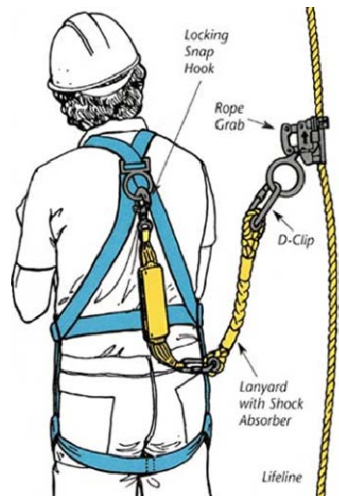
Figure 2: Fall Arrest System

Fall Protection Systems – Fall protection systems protect personnel from the risk of falls to a lower level when working at elevated heights. These specific systems should prevent or eliminate falls or control fall hazards to avoid serious injury.