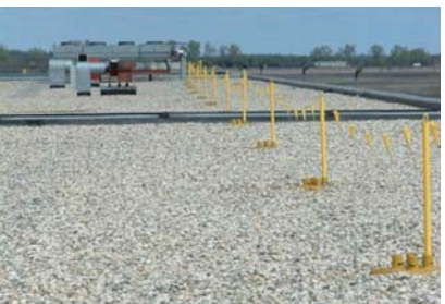
Fig. 7: Warning lines keep workers aware of and away from roof edges.

Hazardous exposures include working over/around dangerous equipment, open pit areas, floor or roof openings, open tanks and vats, overhead work, and roof jobs. Guardrails, safety nets ( Fig. 6) or personal fall arrests are some of the systems that should be in place to prevent injury. If roof work is being done, a designated area with a warning line system ( Fig. 7) could keep workers away from danger. In some cases controlling access to a fall hazard by limiting the number of employees around the hazard might be the best way to prevent injury. Falls through roofs or floor openings can be easily prevented by covering holes with clearly marked covers. It is important to barricade around holes before removing covers to work. Use appropriate fall protection when working near wall or floor openings ( Fig. 8). Highlight all barricaded hazards with signs.