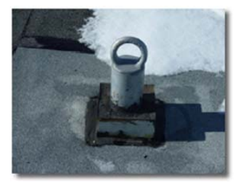
Fig. 4: Anchor Point

Personal fall restraint systems are designed to keep the worker from reaching a fall point, e.g., a roof edge or elevated surface. Anchor points ( Fig. 4 ) attach to a travel restraint ( Fig. 5 ). Employees are able to attach a lifeline to the harness and anchor using locking snap hooks, locking "D" clips or a locking carabineer clip. This device is designed to allow the employee to reach the work area freely without falling over the edge. Several of these anchor points can be affixed along roofs or ledges allowing easy access to any job. Travel restraints