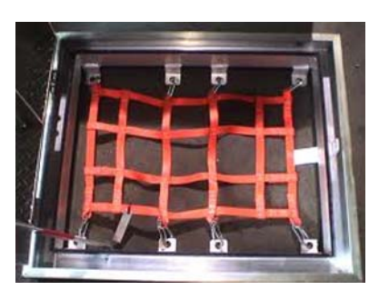
Fig. 8: Net coverings prevent workers from falling to lower level.