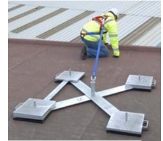
Fig. 5: Fall Restraint System