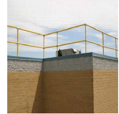
Fig. 1: Guardrails along roof edge

The employer must install guardrail systems where feasible and when fall arrest systems, fall restraint systems, or safety nets are not in place ( Fig\ 1 ). Guardrails are a first line of defense for fall protection. According to OSHA, the top edge of the guardrails must be between 39 and 45 inches above the walking area, taking into account all circumstances. For example, if an employee is using a step ladder near the railing, the top rail will need to be raised or other fall protection means used while the step ladder is in place. Guardrail systems must be able to withstand a force of 200 pounds without failure. A guardrail system is not required if alternatives such as personal fall restraint systems, fall arrest systems, or safety nets are in place.